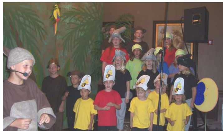
Wonderful Performances given by our CAFA Kids !