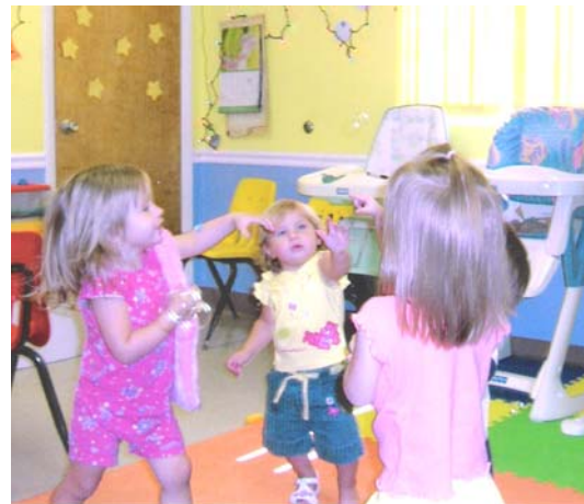
Angels at play in Sunday School