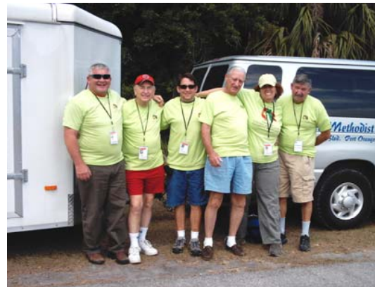
Drivers getting ready for a Mission trip