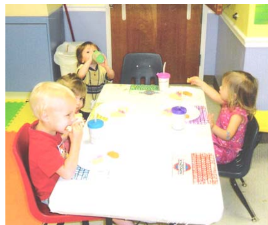
Angels snacking at Vacation Bible