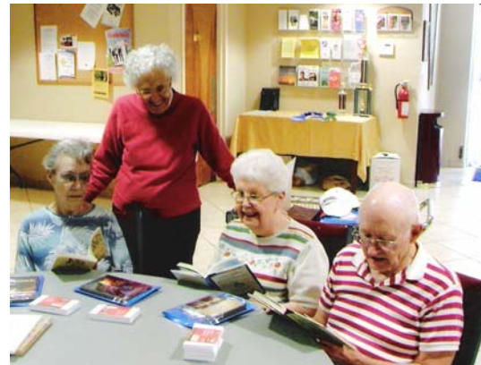
Library Staff Setting up the Books